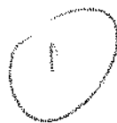
Figure 10. Map of Alebtong district showing all the sub counties.

Figure 9. Showing vaccination of birds against NCD