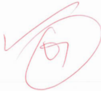
Figure3: field marking